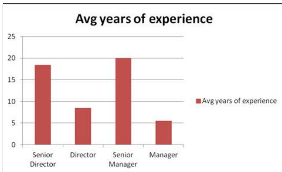
Figure 3. Participants' Average years of Experience